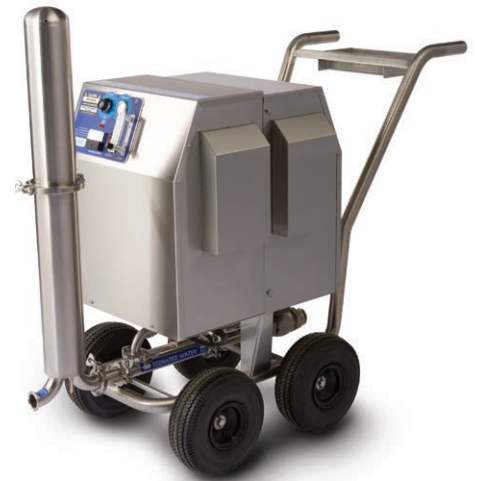
Model: PC 16 Portable Ozone Contacting System