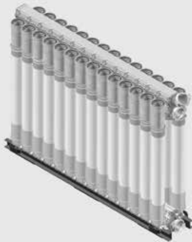
MEMCOR® CP II SYSTEM ASSEMBLY RACK