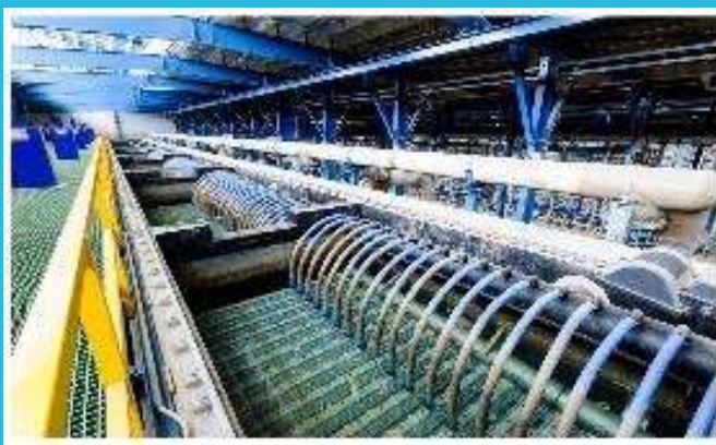
LARGE MEMCOR® CS SYSTEM ADELAIDE DESALINATION PROJECT