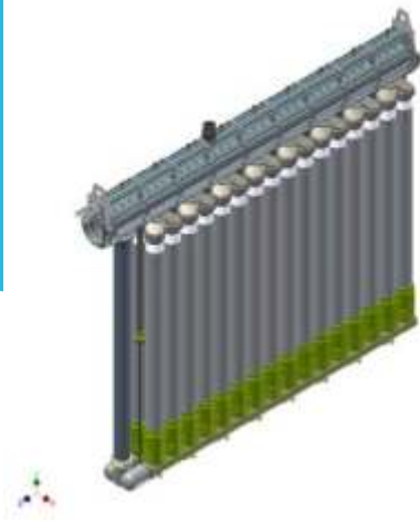
MEMCOR® CS II MemRACK